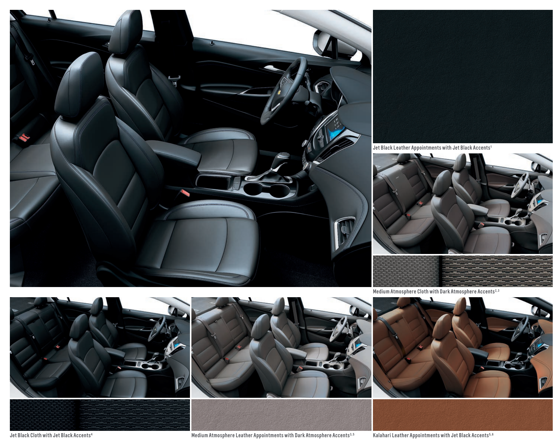
1 Standard on Premier. 2 Available on LS and LT. 3 Not available with Red Hot exterior color. 4 Standard on L, LS and LT. 5 Available on Premier. 6 Not available with Red Hot, Arctic Blue Metallic and Kinetic Blue Metallic exterior colors.