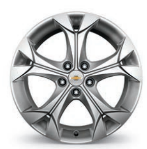
17" Aluminum (Standard on Premier)