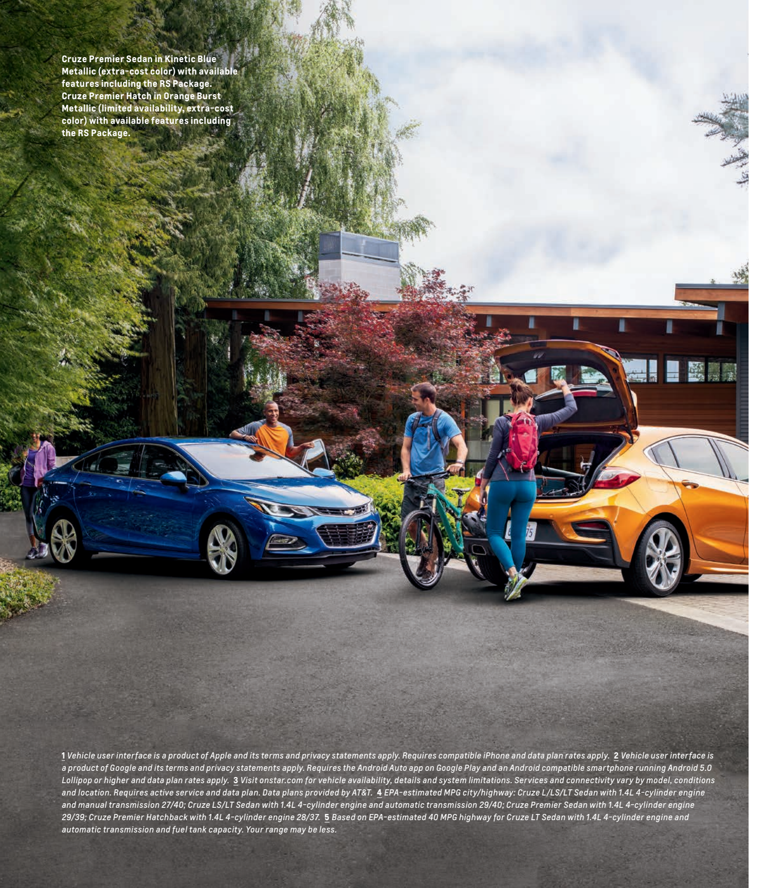
CHART YOUR OWN COURSE.

The 2018 Chevrolet Cruze and Cruze Hatchback make it easier than ever to explore life's possibilities. A suite of available technologies including support for Apple CarPlay™¹ and Android Auto™² and available built-in 4G LTE Wi-Fi®³ keeps your life connected. The design is smart and sporty. The interior is spacious and stylish. It's no wonder Cruze has received so many accolades.