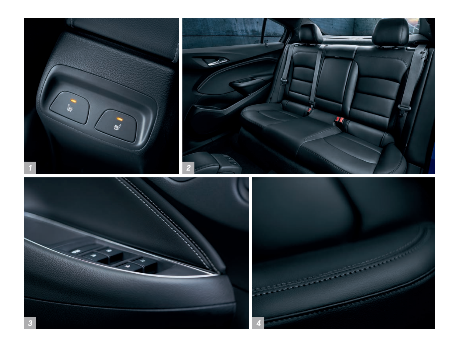
\underline{\textbf{1}} Does not detect people or items. Always check rear seat before exiting.