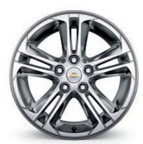
16" Aluminum (Standard on LT)