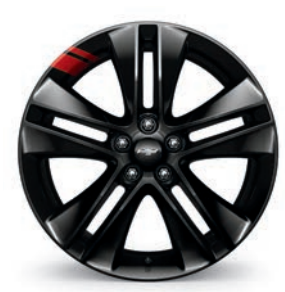
18" Black-Painted Aluminum with Red Accents (Available on LT with Redline Edition)