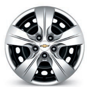
15" Steel with Painted Wheel Cover (Standard on L and LS)