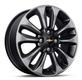
15" Black-Painted Machined-Finish Aluminum Wheels Available on 1LT with Spark Special Edition