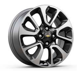
15" Gunmetal Silver-Painted Aluminum Wheels Standard on ACTIV