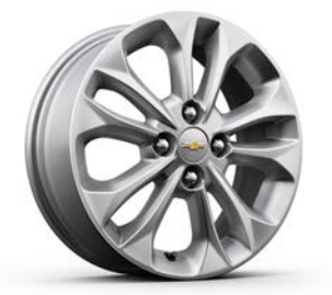
15" Silver-Painted Aluminum Wheels Standard on 1LT