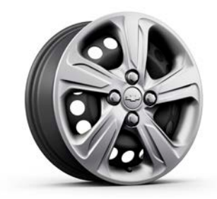
15" Steel Wheels with Painted Wheel Covers Standard on LS