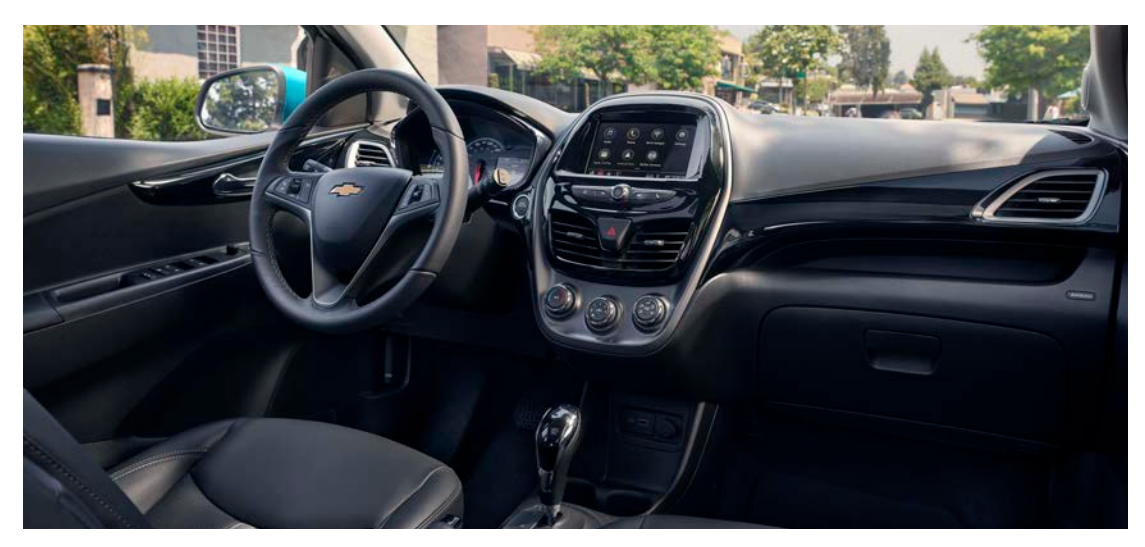
Spark 2LT interior in Jet Black.